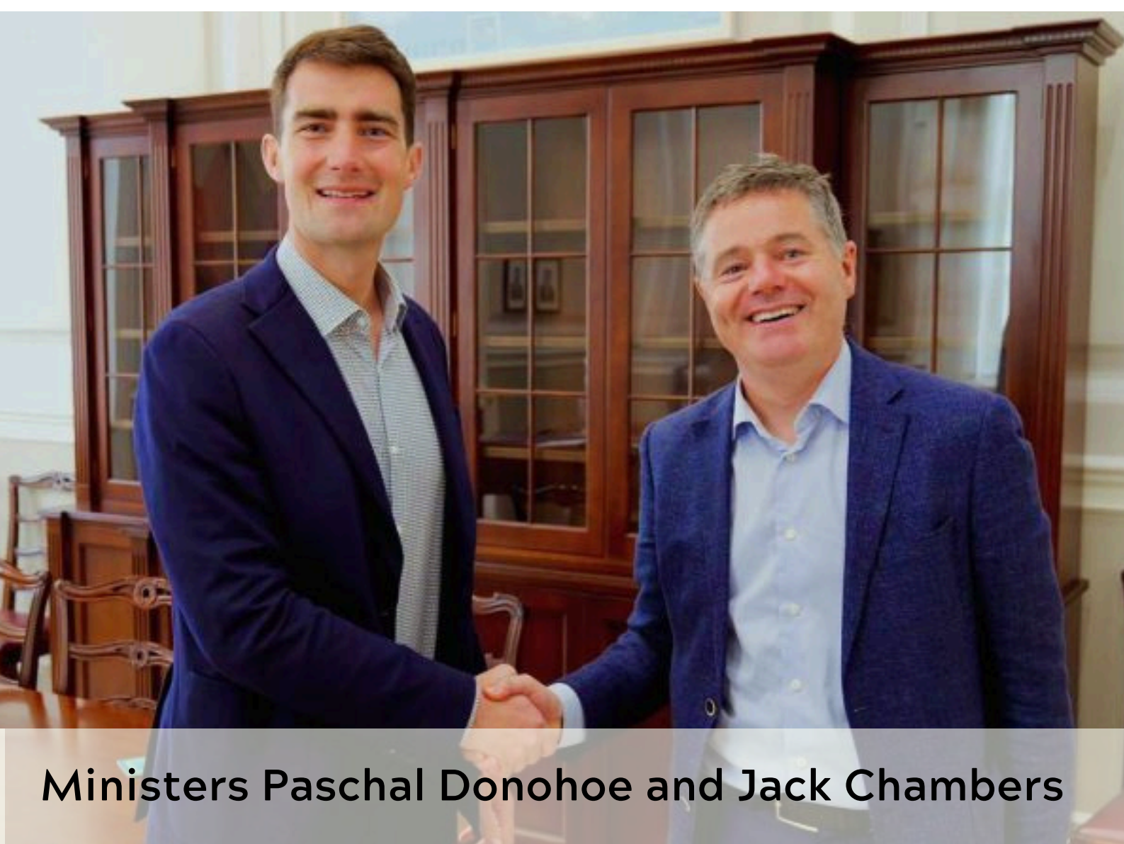
Ministers Paschal Donohoe and Jack Chambers